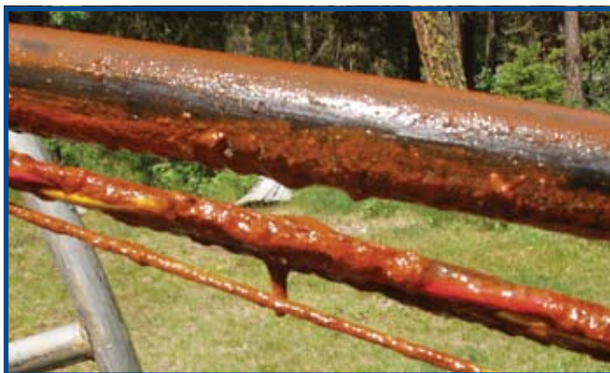
Figure 3. Biofilm on well wiring

Nuisance bacteria such as iron-related or sulphate-reducing bacteria are often found in groundwater and water wells. If uncontrolled, these bacteria can colonize the intake area of a well. The colonies form a sticky, slimy substance called biofilm (see Figure 3 below) which can reduce well production and degrade water quality. Also, minerals in groundwater can settle out and accumulate on well screens over time. The simple chlorination method is not effective in penetrating or removing biofilm and mineral build-up. To prevent the accumulation of biofilm and minerals regular disinfection of the well is recommended in cases where bacteria have been detected.