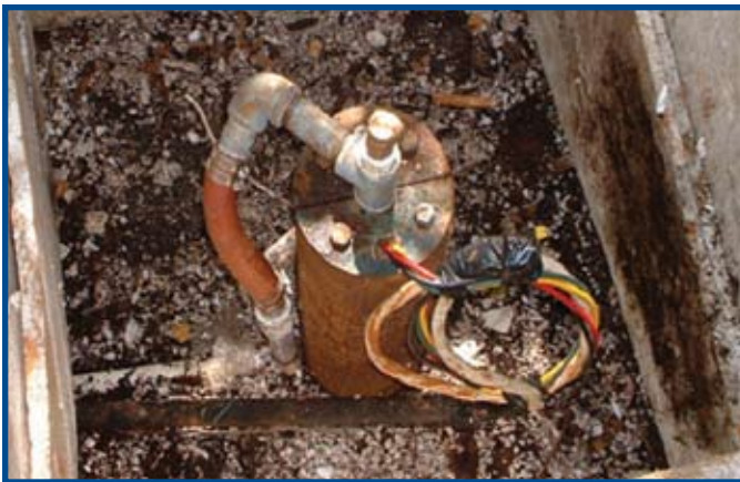
Figure 5. Well with sanitary seal type cap

Caution: Do not remove any of the bolts in the top of the sanitary well seal.