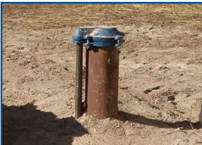
Figure 6. Well fitted with pitless adapter, cap has space for wiring

If possible, mix the water in the well by attaching a clean hose to a nearby water tap or hydrant, placing the other end of the hose into the top of the well casing, and then running the water from the well through the hose and back into the well. Note: the power to the pump will need to be turned back on. After mixing, let the water stand in the well for a couple hours before proceeding to the next step.