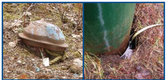
Figure 1. Well casing stick up less than 30 cm (12 inches) from the ground surface

If you answered “ yes ” to any of the above questions, fix the problem before proceeding with disinfection. Otherwise the well will continue to be vulnerable to contamination.